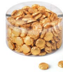
Chapas Choc Leche 6g Ref: 1487