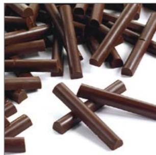
Barritas Choc 45% L C/6kg Ref: 4220