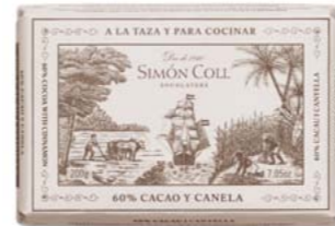
Chocolate a la Piedra 60% Canela 200g Ref: 5592