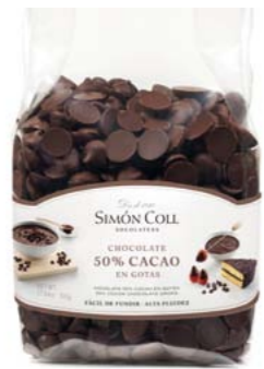
Gotas Choc 50% B500g Ref: 5596