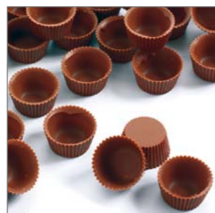
Petifours Leche 6g Ref: 4310