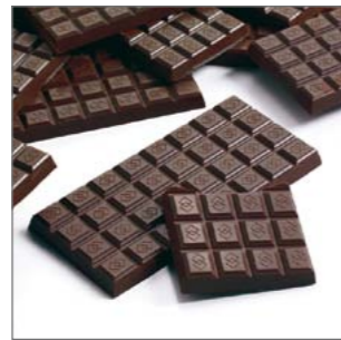
Choc 50% para fundir 7kg Ref: 4030