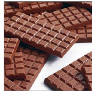
Choc 32% para fundir 7kg Ref: 4060