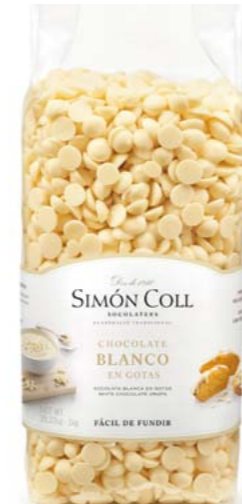
Gotas Choc Blanco B1kg Ref: 8540