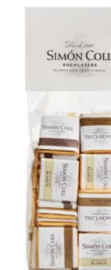
Napolitanas surtidas 5g B100 Ref: 8758