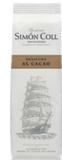
Taza 28% cacao (canela) 200g Ref 200g: 1245 Ref caja 7kg: 1247