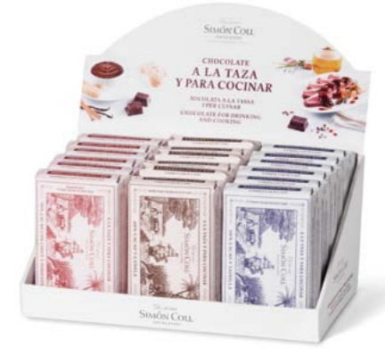
Expositor Surtido Chocolate a la Piedra 18u Ref: 5595