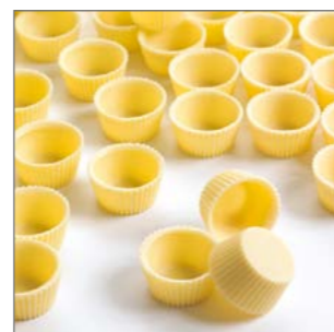
Petifours Choc Blanco 6g Ref: 4320