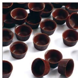
Petifours Choc 50% 6g Ref: 4300