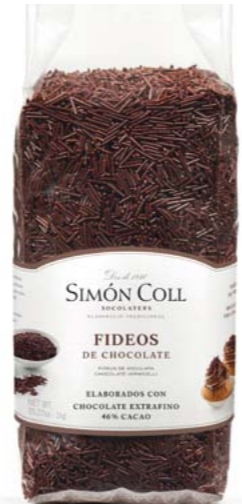
Fideos Choc 45% B1kg Ref: 4100