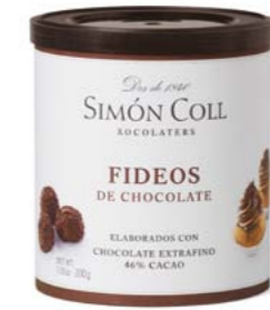
Fideos Chocolate 46% 200g Ref: 5645