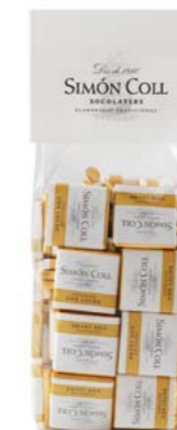
Napolitanas leche 5g B100 Ref: 8753