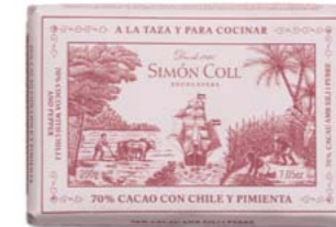
Chocolate a la Piedra 70% Chili y Pimienta 200g Ref: 5594