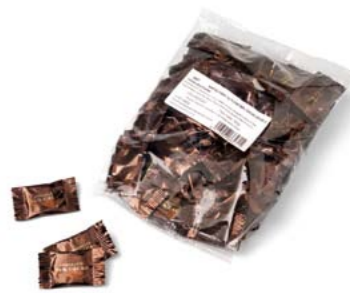
Napolitanas 56% Flow 3g Ref B100: 6657 Ref C400: 7269