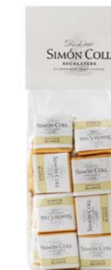
Napolitanas Blanco 5g B100 Ref: 8756