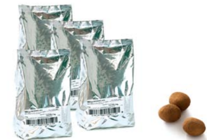
Amatlons C/4 kg Ref: 7998