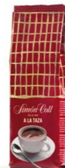
Taza 18% cacao (vainilla) 180g Ref 180g: 6074 Ref caja 7kg: 1243