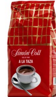
Taza 18% cacao (vainilla) 500g Ref: 8498