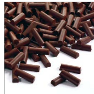
Barritas Choc 45% planas C/6kg Ref: 4230