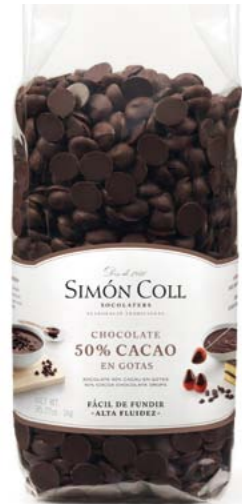
Gotas Choc 50% B1kg y Caja 10kg Ref 1kg: 8539 Ref caja 10kg: 4020