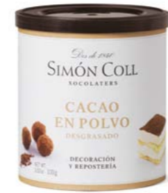
Cacao en Polvo 100g Ref: 5646