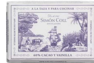
Chocolate a la Piedra 60% Vainilla 200g Ref: 5593