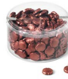
Chapas Choc 50% 6g Ref: 1486