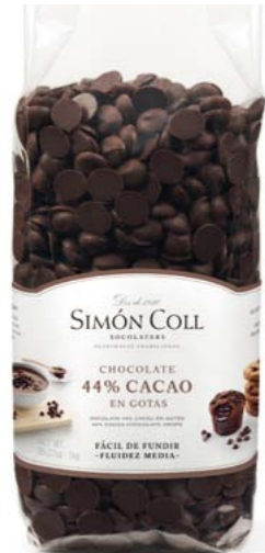
Gotas Choc 44% B1kg y Caja 10kg Ref 1kg: 8538 Ref caja 10kg: 4110