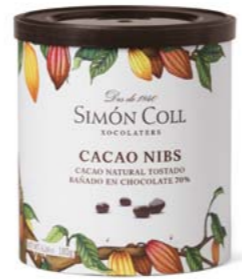
Cacao Nibs 180g Ref: 5644