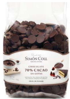
Gotas Choc 70% B500g Ref: 6945