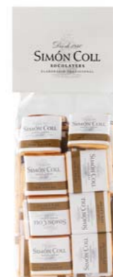
Napolitanas 50% 5g B100 Ref: 8755