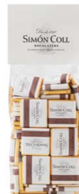
Napolitanas 70% 5g B100 Ref: 8754