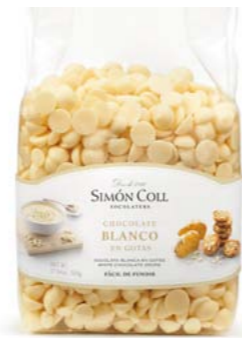
Gotas Choc Blanco B500g Ref: 5597