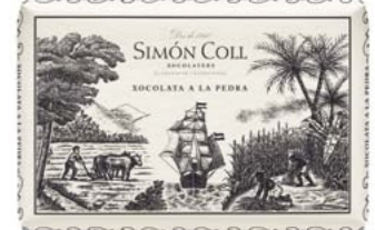
Chocolate a la Piedra 45% Original 200g Ref: 1134