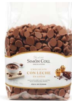
Gotas Choc Leche B500g Ref: 6946