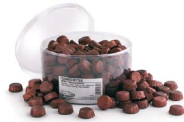
Torinos Choc 50% 6,5g Ref: 1484