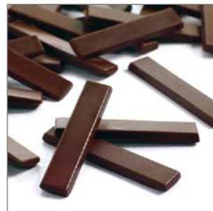
Barritas Choc 45% C C/6kg Ref: 4240