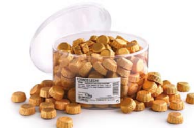
Torinos Choc leche 6,5g Ref: 1485