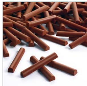
Barritas Leche C /6Kg Ref: 1607